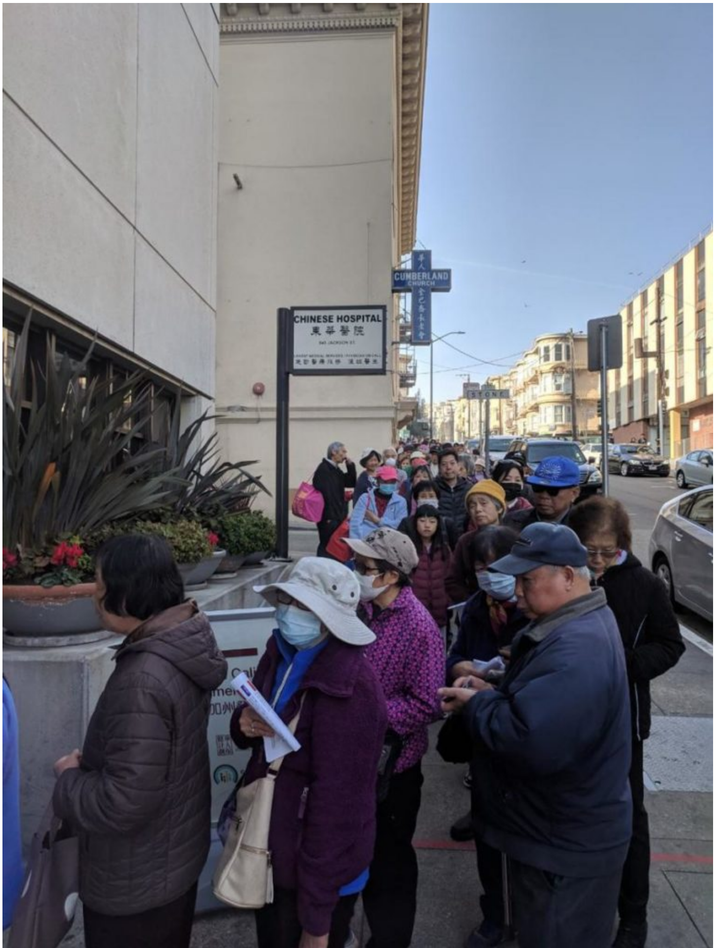
With the Camp Fire still raging in Northern California and winds pushing smoke south, air quality continues as a health hazard in San Francisco. In response, Chinese Hospital will hand out N95 masks on Tuesday, November 20 th .