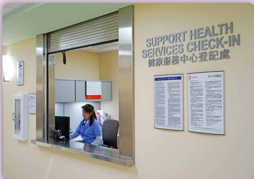
Support Health Services

It has been over a year since Chinese Hospital's New Patient Tower opened to the public. Since then, many patients have had the chance to experience the wonderful new facility and the brand new state-of-the-art equipment to better treat patients and help them to heal quickly.