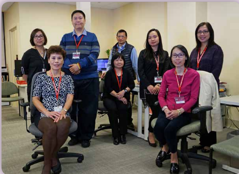
CCHP Member Services