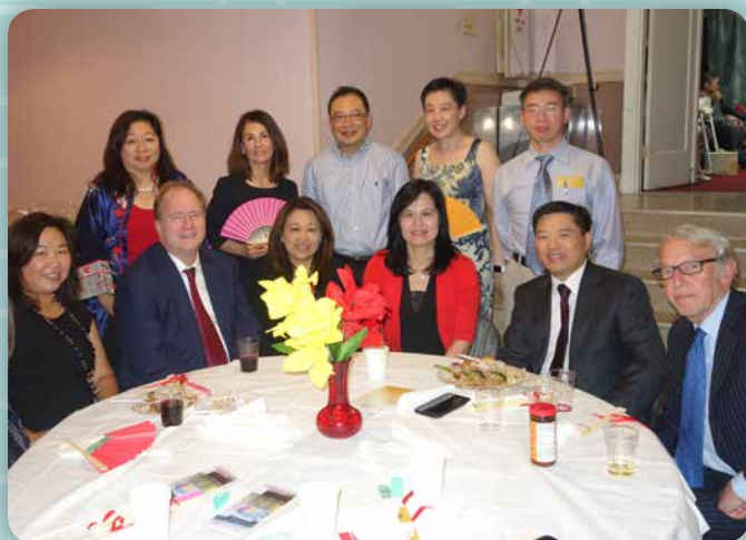
50 th Anniversary Gala

The Chinese Hospital Auxiliary celebrated a night to remember on September 30, 2017. The 50 th Anniversary was no small achievement. Before the establishment of the Auxiliary; women were not formally recognized nor able to advise the hospital on matters of health, and the special needs of women.