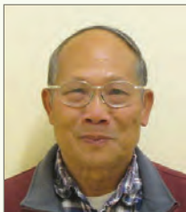
Robert Chiang Yan Wo Benevolent Association