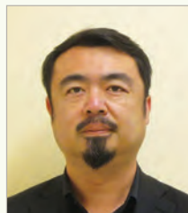
Clifton Leung Chee Kung Tong