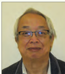
Lawrence Wong Yeong Wo Association