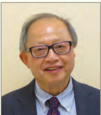
Jack Sit Kong Chow Benevolent Association