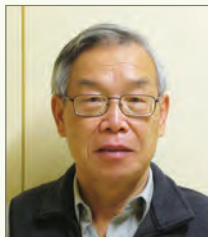
Ding Bong Lee Ning Yung Benevolent Association